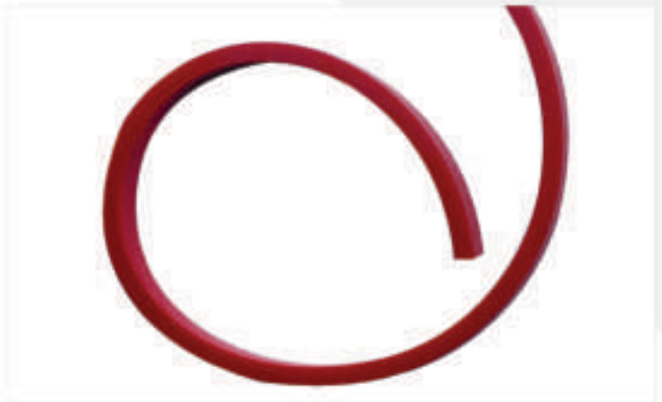
HPLF LIP SEAL