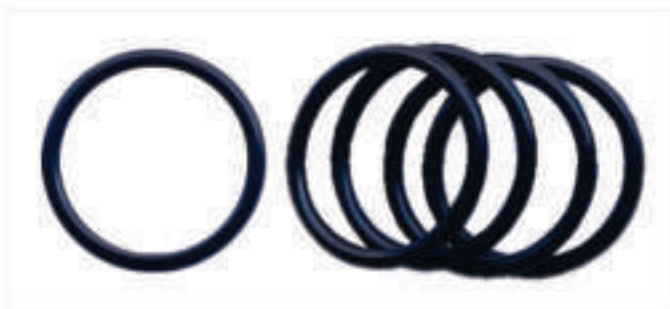
NOZZLE 'O' RINGS