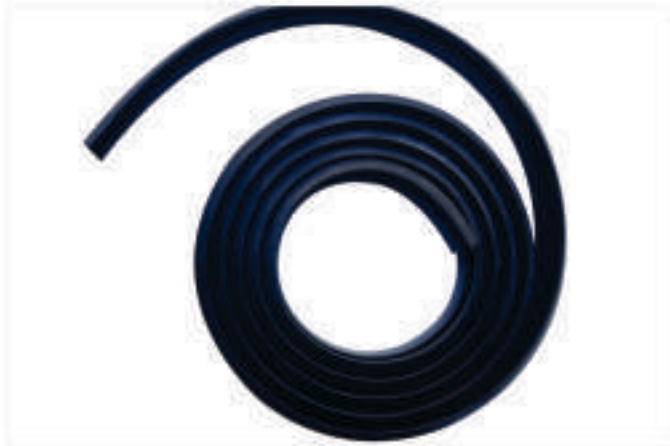
VPLF LIP SEAL

Filtrex Ind. Pvt. Ltd. recommends to choose correct material for a particular application. All our rubber parts has proper hardness as per the application.